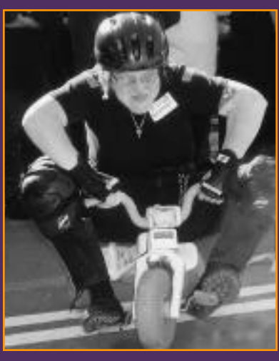
obstacle course on "challenging" transportation. This is truly a race everyone wins!

Using incentives and agency speakers, Chronimed's campaign had a number of events around the theme that we are all racing to help the community. One of the big highlights was a tricycle race where participants maneuvered an